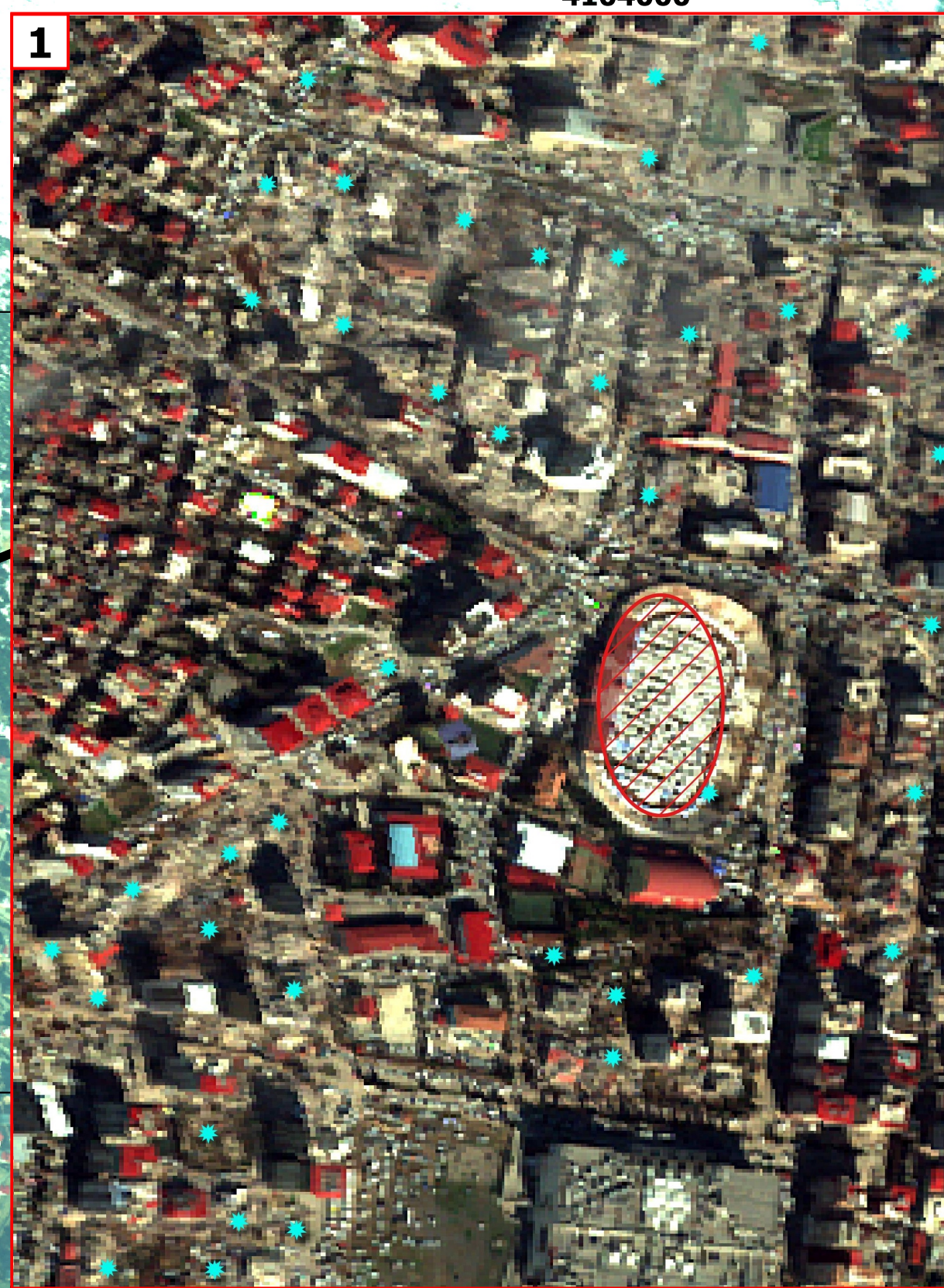
WorldView-2 image, destroyed and damaged buildings after earthquakes, [08/02/2023]