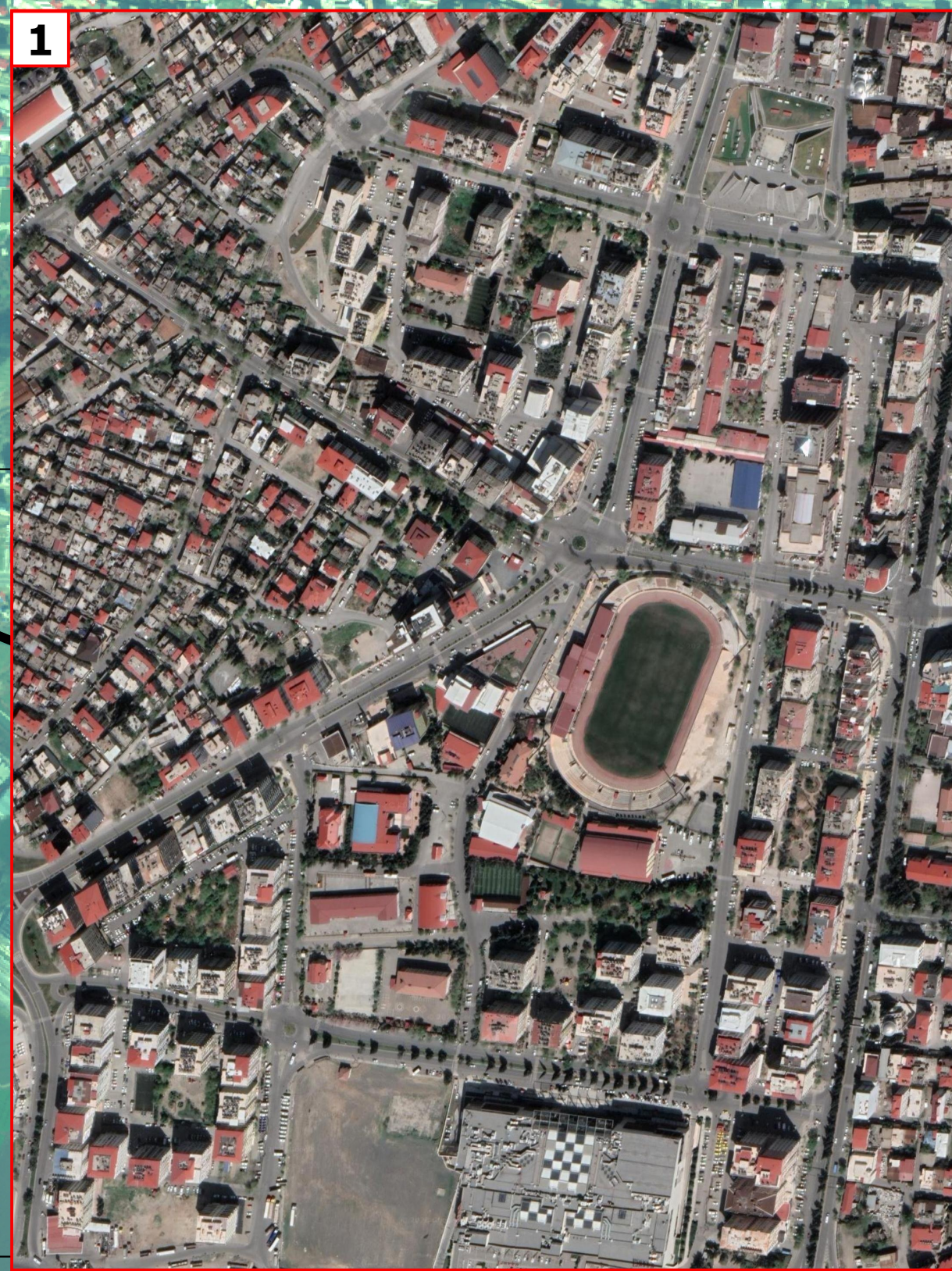
Maxar Technologies image, situation before earthquakes

Satellite: WORLDVIEW-2 Imagery date: 08 February 2023, 09:02 UTC Resolution: 2.6 m ★ destroyed, damaged and possibly damaged buildings ⊘ temporary camps Coordinate system: WGS 1984 UTM Zone 37N © (C) COPYRIGHT 2008 DigitalGlobe, Inc., Longmont CO USA 80503. DigitalGlobe and the DigitalGlobe logos are trademarks of DigitalGlobe, Inc. The use and/or dissemination of this data and/or of any product in any way derived there from are restricted. Unauthorized use and/or dissemination is prohibited. Pre-event image: Image © Maxar Technologies Map produced by UE "Geoinformation systems"